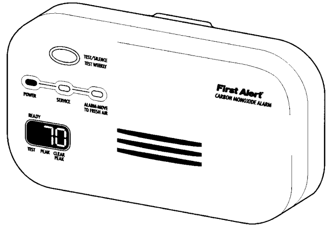
Figure 2-3. Carbon Monoxide Detector

The best location for a CO detector is on a wall in your sleeping area, about 5 feet from the floor. Place it where you will see it every night before you go to bed so you will remember to check the level.